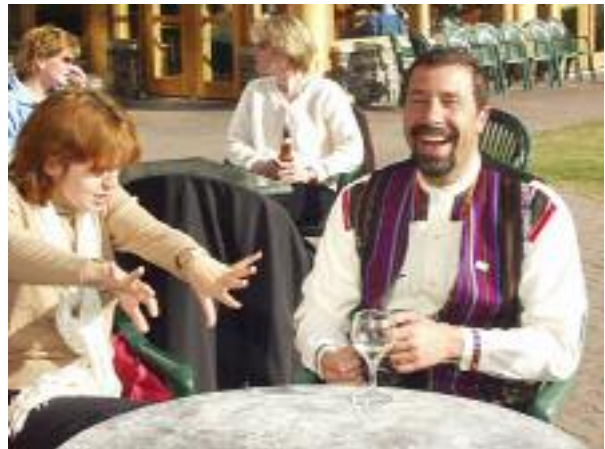
Enjoying the sunshine at the Awards Banquet Outdoor Barbeque