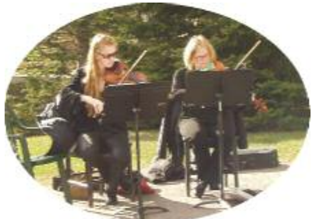
Duo Rouge - Gala Musicians