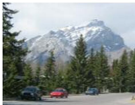
View from the Centre

There were some complaints; the session rooms were too well air-conditioned, last minute changes affected peoples travel plans and not every workshop was what the attendees expected but all-in-all a successful conference. All the comments will be forwarded to the next conference committee to ensure the conferences keep improving.