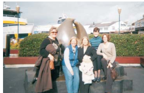
CANAC nurses playing tourist in San Francisco